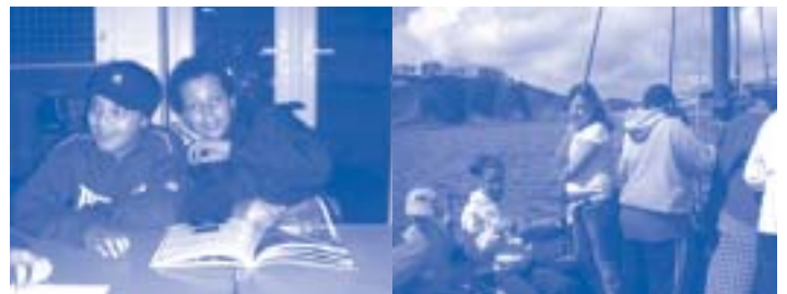
left: Looking for inspiration. Young people taking part in a Graffiti Workshop; right: Groups of young people from Easton visit Cornwall as part of Baggator's Action Learning programme.