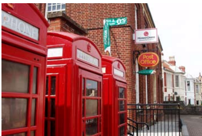
Westbury post office