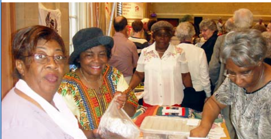
Members of the Golden Agers group