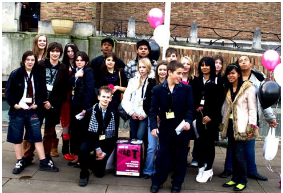
Candidates for the 2008 elections

To find out more information about UKYP, please visit: www.ukyp.org.uk