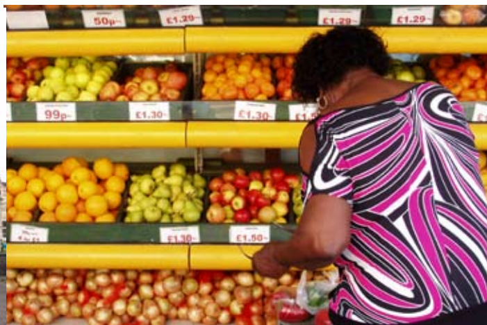
Buying groceries on St Marks Road