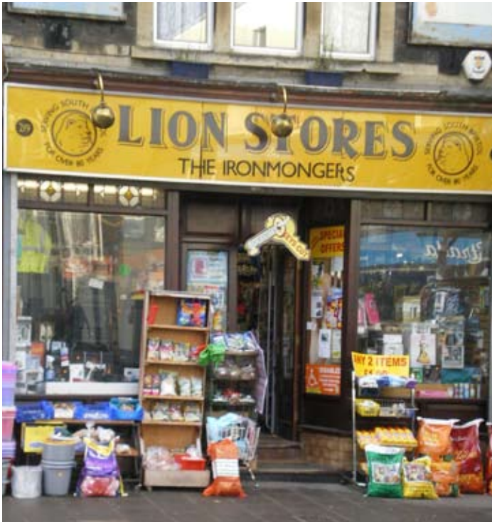
Lion Stores, North Street