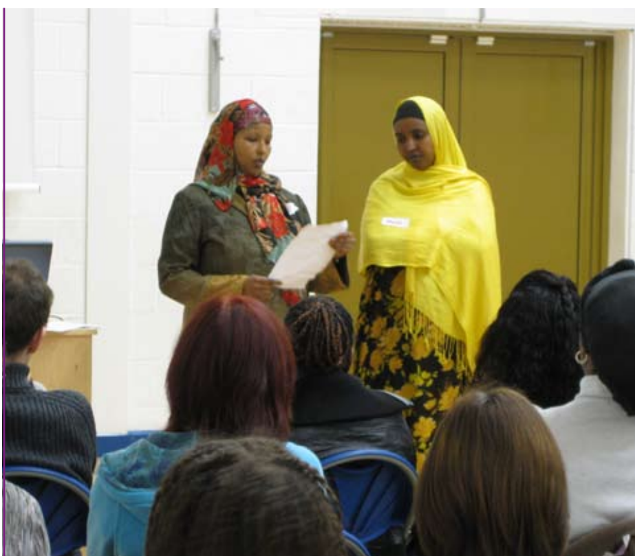
Somali women deliver a cultural awareness session